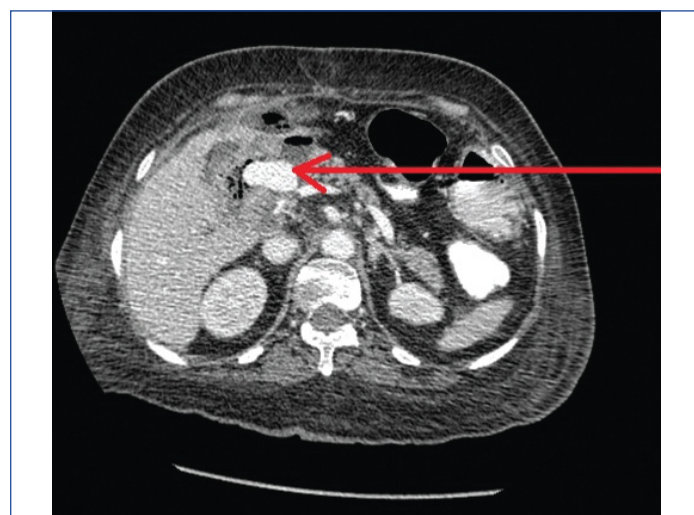
[Table/Fig-1]: Contrast CT scan prior to stenting showing pseudoaneurysm arising from the main portal vein as pointed by the red arrow.

A 60-year-old female patient presented in casualty with abdominal pain, vomiting and melena. Two months earlier, she had been diagnosed with carcinoma head of pancreas for which she underwent pylorus-preserving pancreaticoduodenectomy. Her intraoperative course was uneventful. However, on postoperative day six she developed fever. A Computed Tomography (CT) scan was done which showed a peripancreatic collection for which CT guided aspiration ensued. She was discharged on the 11 th postoperative day with the normal expected post-surgical course. On admission, her Haemoglobin (Hb) was 3.2 g/dL, platelet count- 2,51,000/cumm, WBC count- 22,000/cumm, serum lactate-144 mg/dL, drain fluid amylase was 8088 U/L. CT scan of the abdomen showed a portal vein pseudoaneurysm [Table/Fig-1].